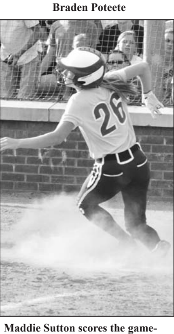
winner vs Dawson County away from becoming just the

fifth Lady Panther to record at least 30 two-baggers in their career.