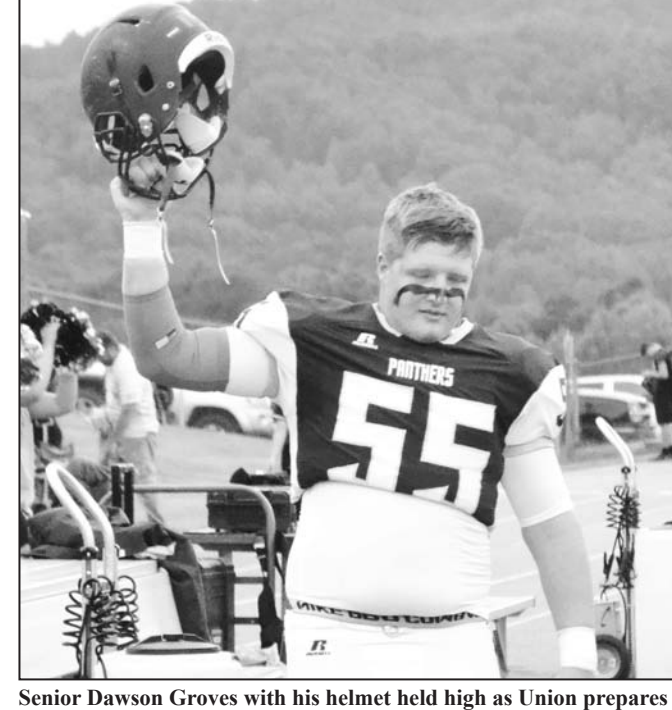
to kickoff to open the game.

Three plays later, Rabun Gap used a 14-yard touchdown pass for its first, and only, score of the game.